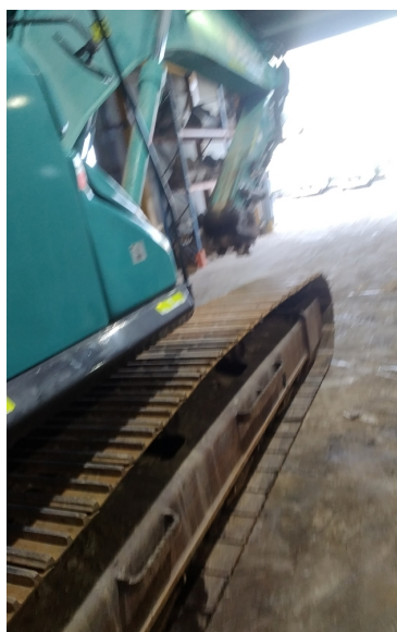
Tyre Condition 4