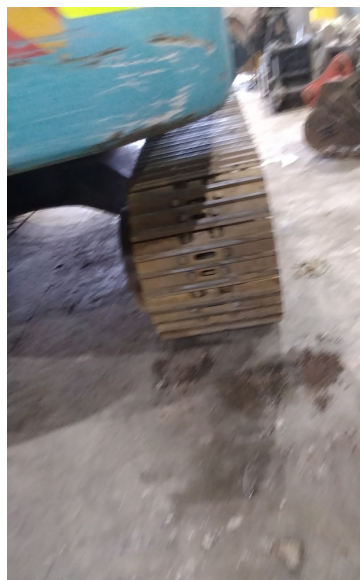
Tyre Condition 1