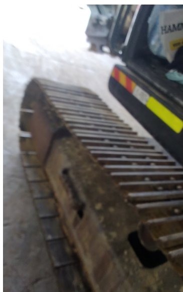
Tyre Condition 4